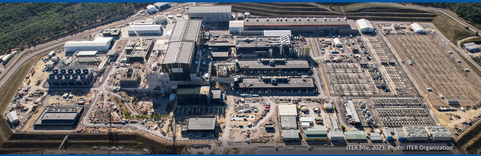
ITER Site, 2023.