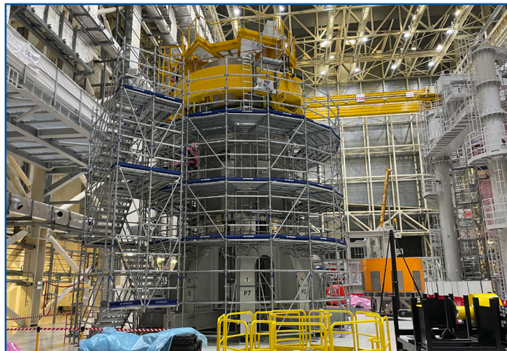
US ITER is delivering the “heart of ITER,” the superconducting central solenoid magnet. The first three magnet modules are stacked for assembly.

The ITER project evolved from post-cold war discussions between the United States and the Soviet Union. During the Geneva Summit in 1985, Presidents Reagan and Gorbachev discussed a collaboration to develop fusion for peaceful purposes. After extensive planning and the addition of new partners, the ITER Agreement was signed in 2006 as a U.S. Congressional-Executive Hybrid Agreement with treaty-like status.