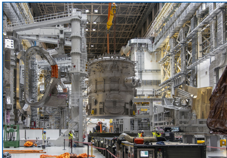
A view of the ITER assembly hall as an auxiliary cold box is transferred for positioning into the tokamak building.

U.S. project execution is managed by Oak Ridge National Laboratory in Tennessee, with partner labs Princeton Plasma Physics Laboratory in New Jersey and Savannah River National Laboratory in South Carolina.