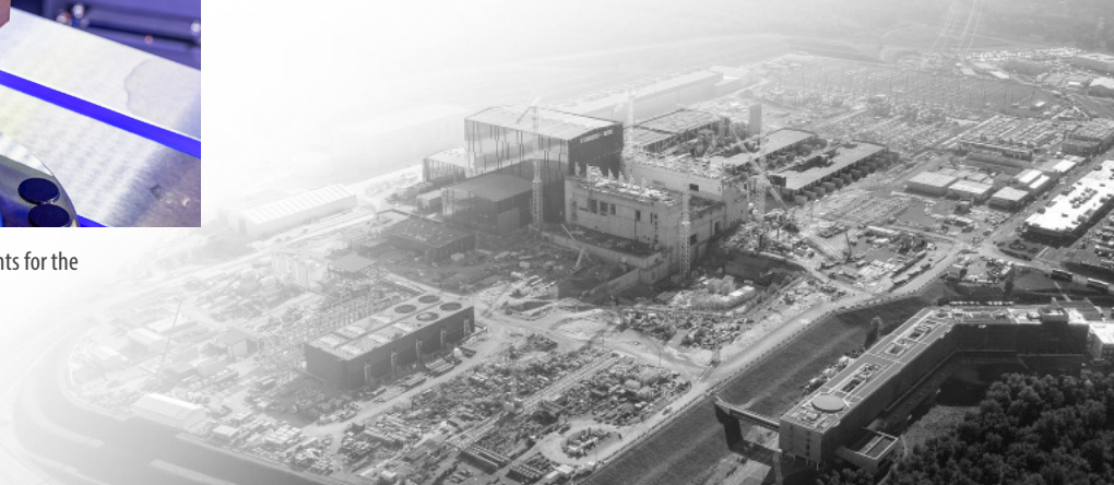
Civil construction is largely complete at the ITER site in France, and machine assembly is underway.

Once assembly is complete, ITER will provide access to flexible operations and extensive diagnostics for R&D needs across U.S. fusion sectors.