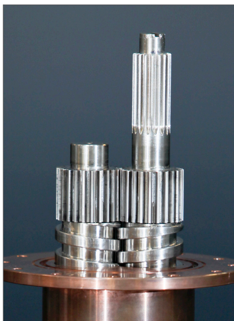
Close-up view of the twin-screw extruder.