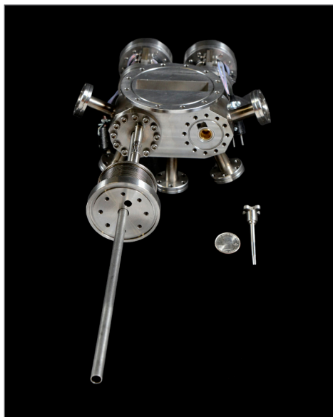
A dual-nozzle prototype was developed for fueling and ELM mitigation.