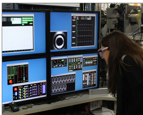
Testing is performed at the ORNL pellet lab.