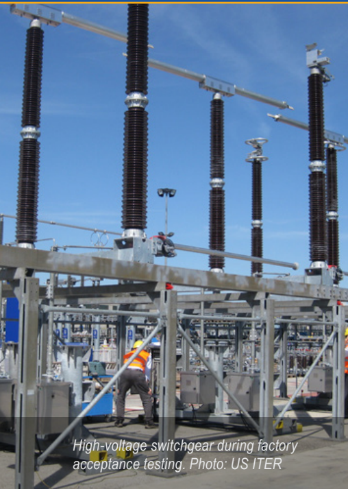
High-voltage switchgear during factory acceptance testing.