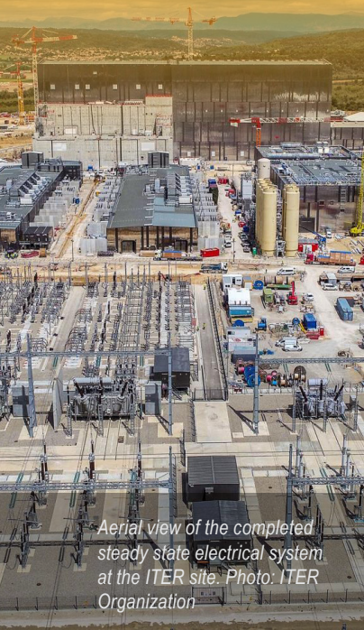
Aerial view of the completed steady state electrical system at the ITER site.

US ITER completed delivery of all components in 2017.