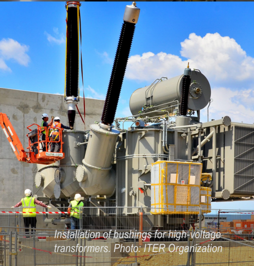
Installation of bushings for high-voltage transformers.