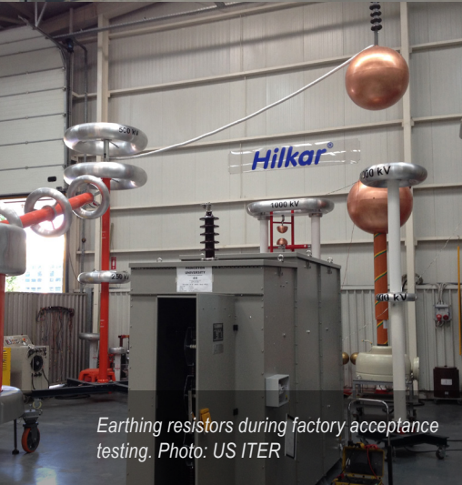
Earthing resistors during factory acceptance testing.