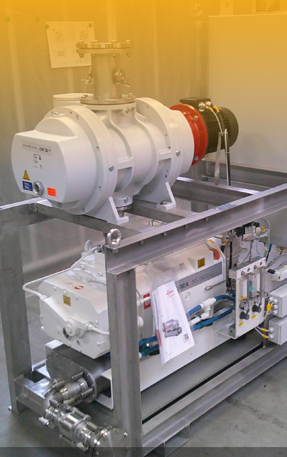
One of the non-active pump skids delivered to the ITER site in 2025.

Final design for the vacuum system will be completed in 2027. Procurement and fabrication activities are in progress for subsystems that have completed final design. Delivered hardware includes vacuum piping systems and subcomponents, high vacuum pumping stations, non-active roughing pumps, leak detectors, electron cyclotron commercial components, valves, and portable vacuum pumping carts.